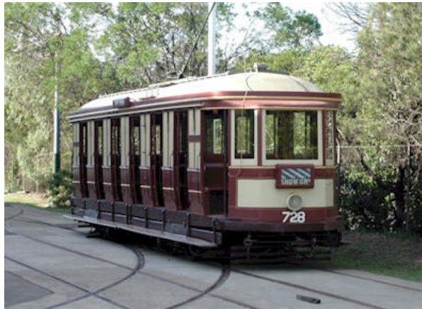
Early tram, Sydney, NSW

It is important to emphasize that the heritage professional should be on the lookout for significant technology when performing a heritage study and not only 'old' engineered and industrial works. The local hospital, telephone exchange, bank or TAFE computer facilities may have more heritage significance than the local bridge or railway precinct.