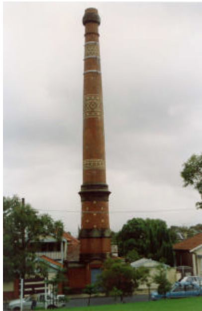
Sewer Vent, Lewisham