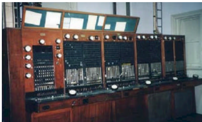
Early telephone exchange with heritage significance