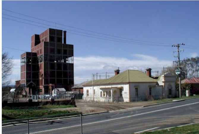
Gasworks, Bathurst, NSW, 1887. The first municipally-owned works in Australia.