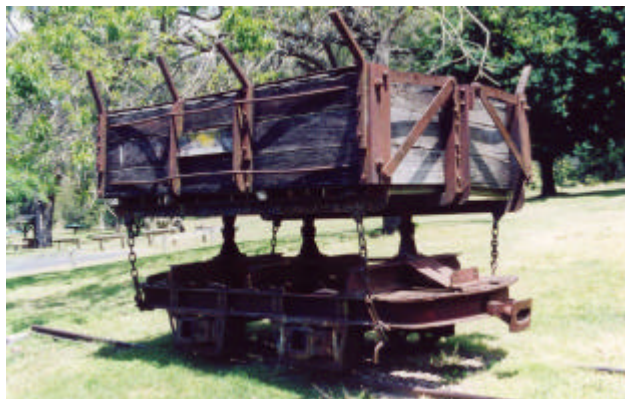
Rail tip wagon, Burrinjuck Dam