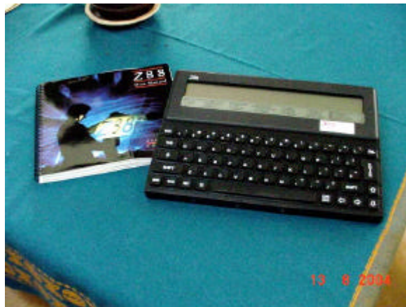
Cambridge Z88 computer, 128kb ROM, 1987

The same rules apply to the assessment of heritage significance of engineering and industrial items as they do to buildings and other heritage items and places. However, since technology changes quickly the time factor or age of an item may have little relevance to the significance of an item. For example, computer and medical equipment have developed rapidly and items only ten years-old may be highly significant, whereas a building may need to be much older before it is considered of comparable heritage value. The small computer shown is only 17 years-old, however it is an example of its class and it may well have significance within computer equipment where technological change is so rapid.