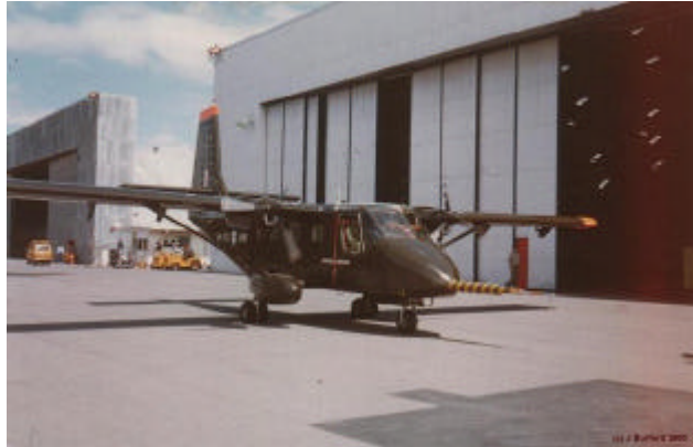
Australia's Nomad aircraft