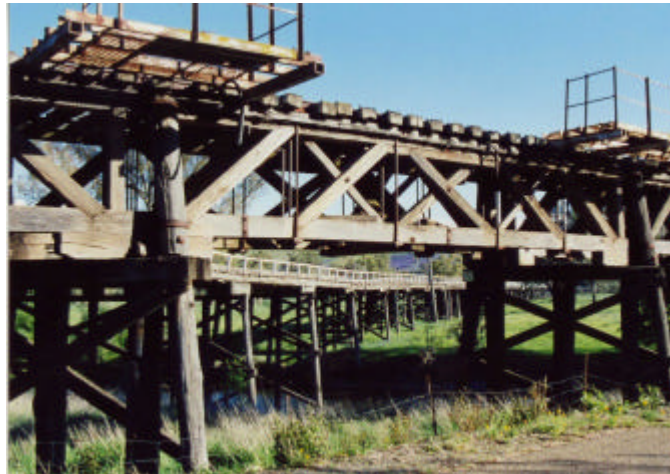
Heritage road and rail viaducts, Gundagai, NSW

Some materials, such as timber, are becoming difficult to obtain in the species and sizes required for conservation. This also makes conservation difficult to sustain e.g. the maintenance of the timber viaducts shown.