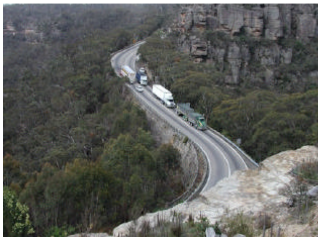
Victoria Pass, built on Surveyor Mitchell's line of 1832, the third crossing of the western escarpment of the Blue Mountains