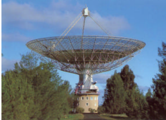
Radiotelescope, Parkes, NSW. Commissioned 1961.