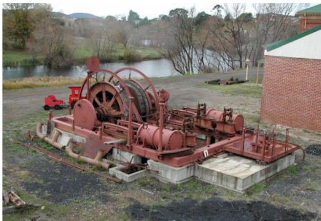
Hebburn steam winding plant, Goulburn, NSW. Originally from the Newcastle coalfields.