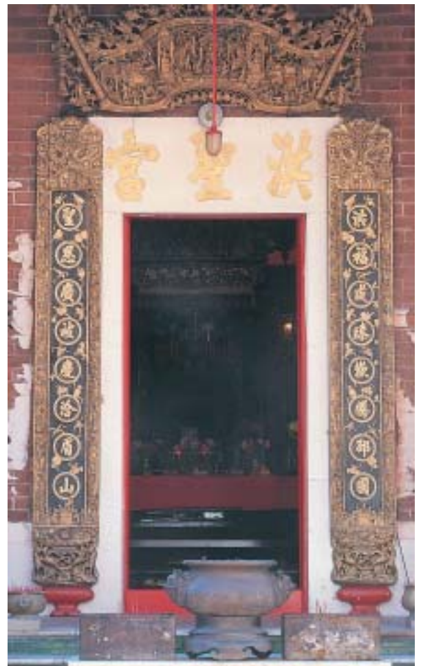
The State Heritage Register includes items of particular importance to specific groups. For over 100 years the Yiu Ming Temple in Alexandria has been central to the lives of some of Sydney's Chinese community.

Heritage items can also be of local heritage significance. Local heritage items are listed in heritage schedules to local councils' local environmental plans (LEPs). For more information on a local heritage item, contact your local council.