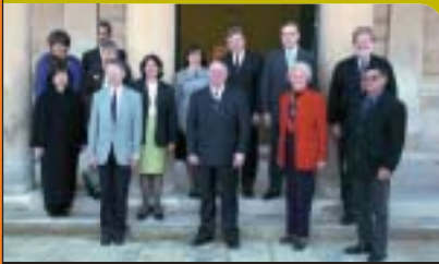
Members of the Heritage Council of NSW.

THE STATE HERITAGE REGISTER IS A LIST OF HERITAGE ITEMS OF PARTICULAR IMPORTANCE TO THE PEOPLE OF NSW. THERE ARE OVER 1,500 PLACES AND OBJECTS LISTED ON THE STATE HERITAGE REGISTER, IN BOTH PRIVATE AND PUBLIC OWNERSHIP.