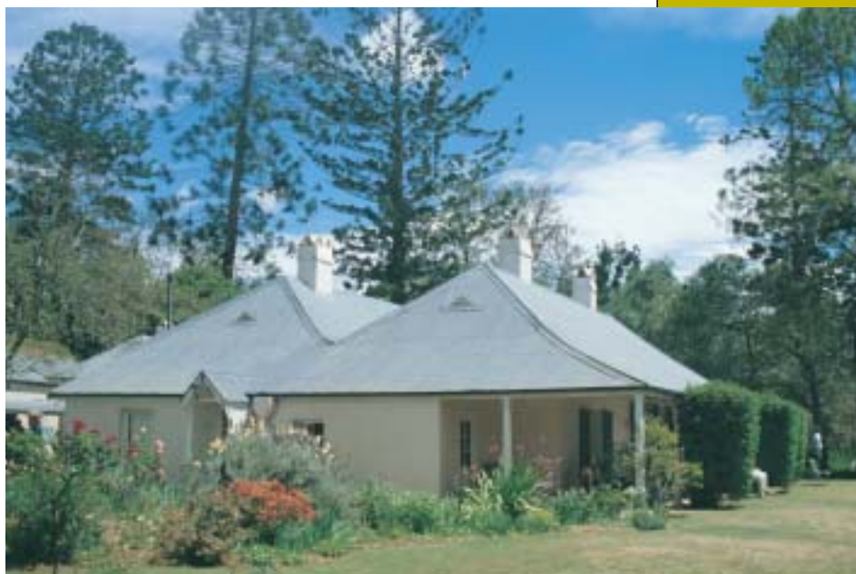
Brownlow Hill, near Camden, was recently added to the State Heritage Register as a rare surviving example of a colonial farming estate.