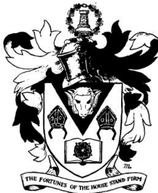
fig. 3: Arms of the City of Armidale (1955) (The motto alludes to the community spirit of the city's inhabitants.)

The Arms, as described above and illustrated below, were befitting a city which could have become the capital of a new state: a city of learning, of faith, of material wealth, respectful of its cultural heritage, enriched by communal endeavour and civic virtue, facing the future with confidence.