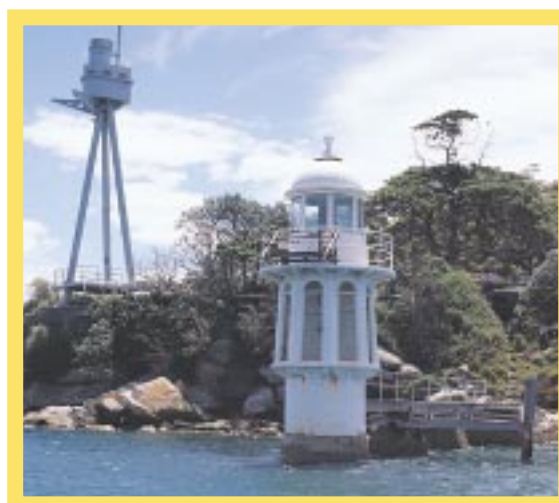
Concrete was used for lighthouses and marine engineering works, such as Bradleys Head Lighthouse in Sydney Harbour. It was the first pre-cast concrete lighthouse in Australia. Constructed in 1905 by Gummow Forrest & Company, it is the earliest example of the use of reinforced concrete in maritime situations and utilises both in-situ and pre-cast sections.