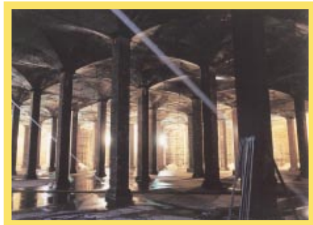
Centennial Park Reservoir No 1., showing mass concrete groined arches and brick columns. The reservoir was completed in 1898 after nearly five years of construction time and was described as “by far the largest of its kind in the Southern Hemisphere”. The reservoir is still operating. Image RS/P/83 LP