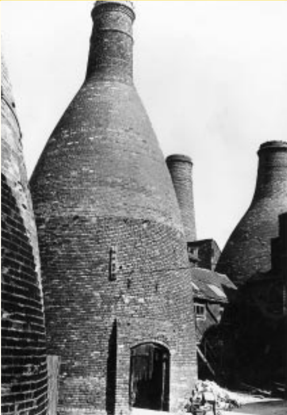
Bottle kilns similar to those used in cement production in the 19th century, photographed in 1889. Portland cement first began to be produced by Australian companies in the 1880s, including the Cullen Bullen Lime and Cement Company at Portland, NSW.