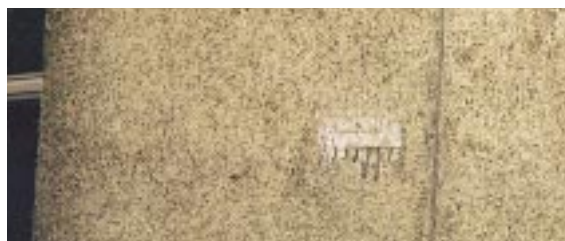
Typical reinforcement corrosion resulting from inadequate depth of concrete covering to the reinforcement.

Care and attention during construction is crucial to the long-term durability of reinforced concrete. Current building codes, including AS 3600, give guidance appropriate to the exposure conditions, and on mix design (particularly the water/cement ratio and amount of cement binder), additives, compaction, detail, and thickness of cover. The type of cement binder is also now well defined. However, this has not always been the case and durability problems of earlier concrete are summarised in the following table.