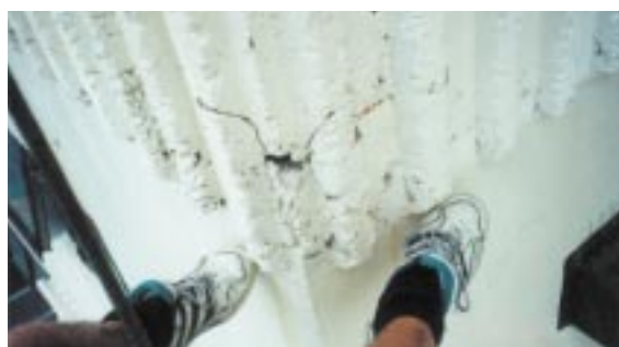
Typical cracked concrete section due to poorly compacted concrete.

Lack of knowledge about the importance of careful selection and specification of materials and the use of additives has created a number of durability problems for historic concrete structures. They can be the result of the use of the following.